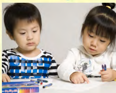
Folkestone Early Years Children's Centre Dover Road Folkestone CT20 1QF 03000 419727