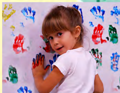
Lydd'le Stars Children's Centre Skinner Road Lydd Romney Marsh TN29 9HW 03000 411 054