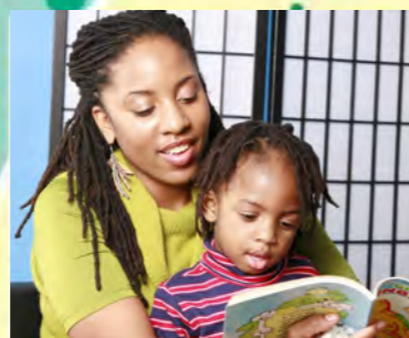
Hythe Children's Centre Hythe Youth Centre Cinque Ports Road Hythe CT21 6HS 03000 421 167