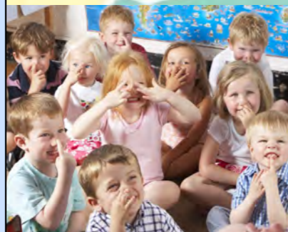
Cheriton Caterpillars Children's Centre Chart Road Cheriton Folkestone CT19 4PN 03000 416 444