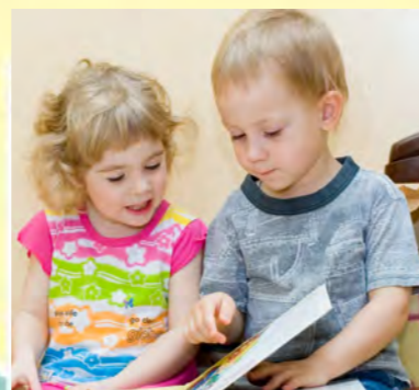
Hawkinge & Rural Children's Centre 111 Canterbury Road Hawkinge CT18 7BS 03000 411 046

Further details from: http://www.kent.gov.uk/education-and-children/childcare-and-pre-school/childrens-centres/folkestone-and-hythe-childrens-centre