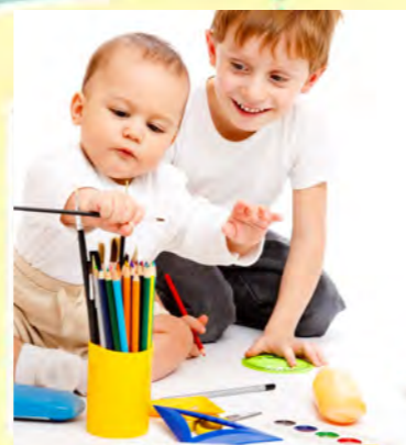
The Village Children's Centre Denmark Street Folkestone CT19 6EQ 03000 420 893