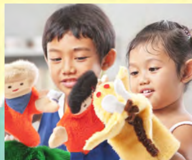
Dymchurch Children's Centre Country's Field Dymchurch Romney Marsh TN29 0NQ 03000 411 055